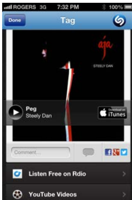
Here's what Shazam gives you when you search a song