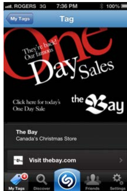
The landing page for the Bay's Shazam-enabled Radio commercials.